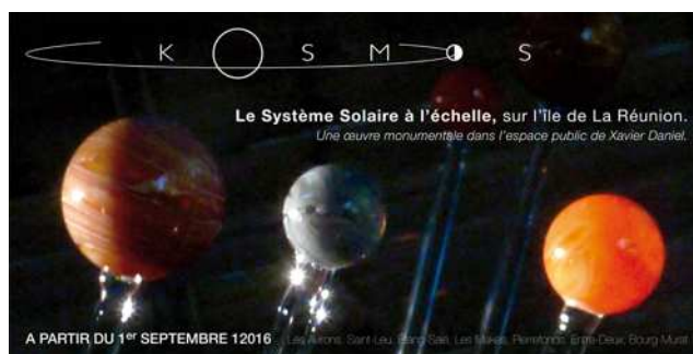
Fig. 6. : Invitation to the Kosmos inauguration ceremony.