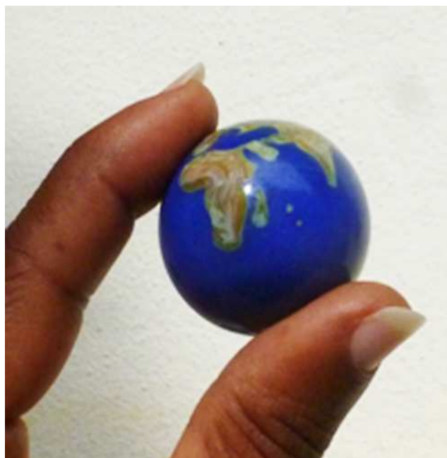
Fig. 4. : "Feeling" the Earth to size.

Offer children of all ages a privileged access to art, you will see them radiate. Promote science, knowledge, consciousness you will see them be amazed. Enhance technological and professional education in demanding projects you will see them enthusiastic. Beyond the technical and scientific challenge, these two years of experimental work brought into play inter-generation, institutional, and municipal cooperation as well as trans-political, pro-social and regional-territorial.