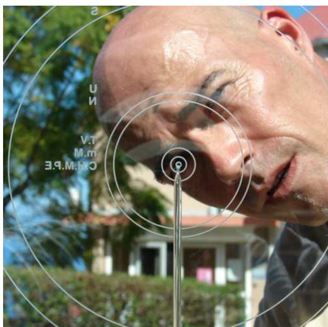
Fig. 5. The 'Father' of the Kosmos project with dwarf planet display.