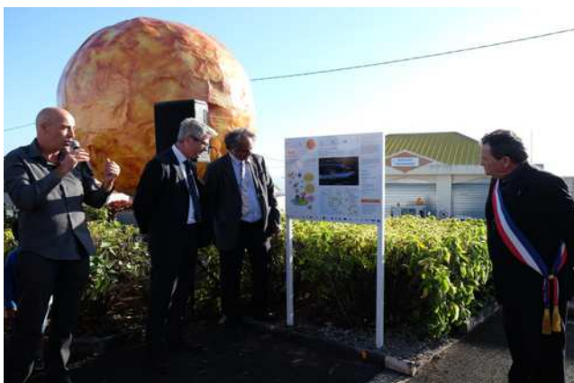
Fig. 3. : Inauguration of the Sun in the city of Les Avirons.

Standing in the garden of Les Avirons Town Hall (Fig. 3.), watching Mercury, this small, fragile ball standing out against the mass of our star, allows ourselves to ponder over things for a while. Let's take a moment to visit Ceres in the asteroid belt, to wonder about our place in this world. And then let's set up a meeting with ourselves near Venus.